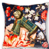
Tokyo Blue Indigo