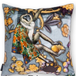
Tokyo Blue Cashmere